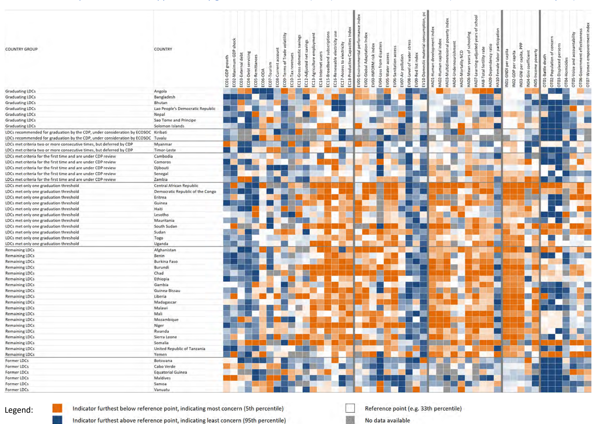
Annex 1: Heatmap extract of the supplementary graduation indicators (SGIs) for LDCs and former LDCs (2022 or latest available year)