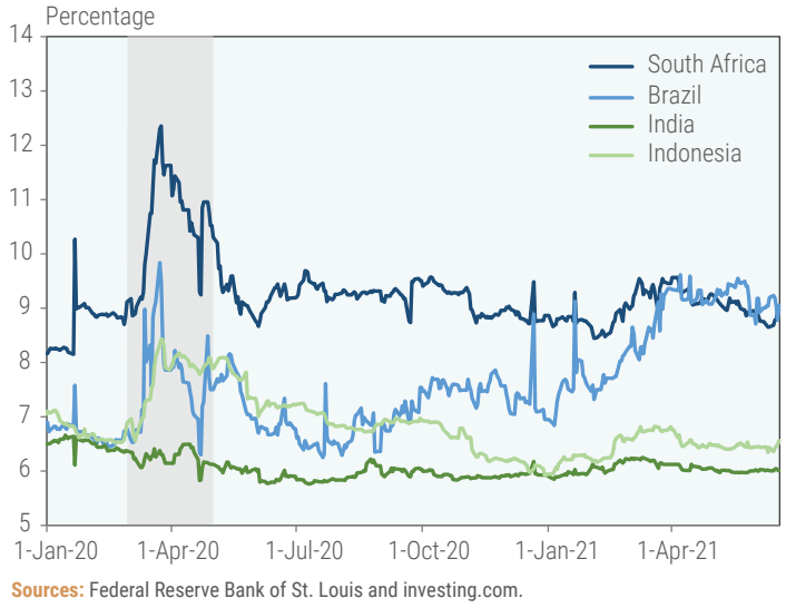
Figure 3 Ten-year government bond yields in selected developing countries

Note: United States recession periods are highlighted in grey.