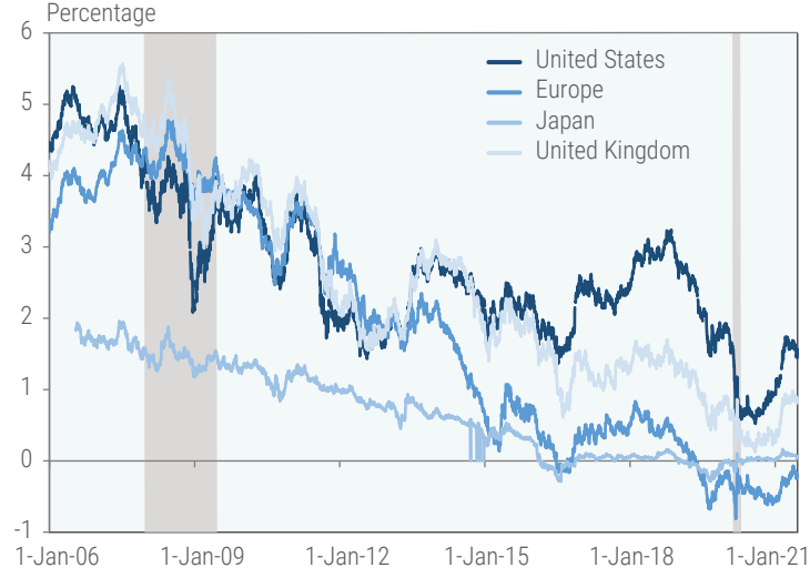
Note: United States recession periods are highlighted in grey.

Given vast differences in macroeconomic situations and policies, it is difficult to quantify the effects of QE. However, there is wide agreement that asset purchases have contributed to falling government bond yields (Figure 2). Bernanke (2020) recently estimated that in 2014 every $500 billion in QE lowered the 10-year