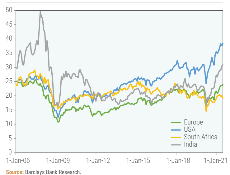
Figure 5 CAPE ratios in selected economies

These strong price increases have spurred fears of a formation of asset price bubbles amid a growing disconnect between financial markets and the real economy. A bursting of asset price bubbles could result in a rising number of bankruptcies and undermine the still fragile global economic recovery.