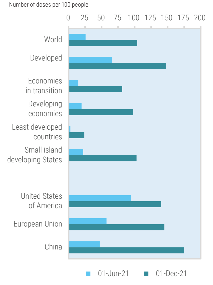
Figure 2 Vaccination progress