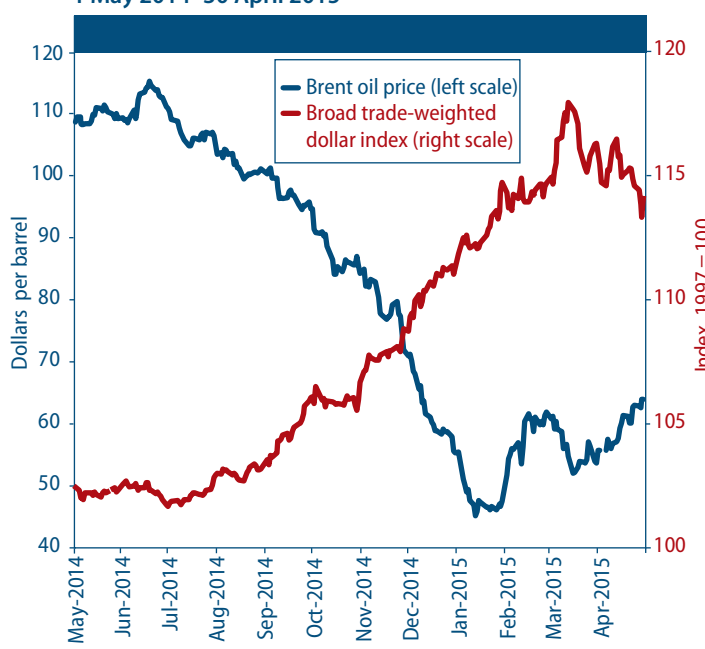
Figure 1 Daily Brent crude oil price and US dollar index: 1 May 2014–30 April 2015